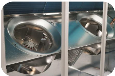
Downflow unit with backward-curved fans