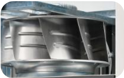
Backward-curved blades fan with EC motor